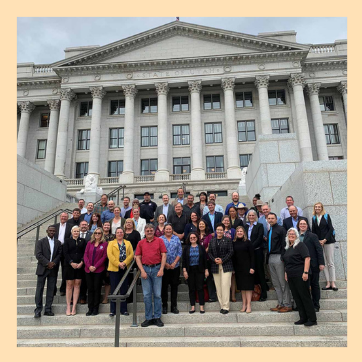
Commission members at their first meeting in Utah.

We're excited to have provided input on empowering Indigenous leadership, expanding young people's involvement, creating a safer work culture for marginalized groups, and better supporting most-impacted communities.